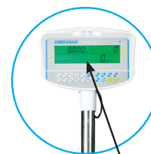
Bright backlit display