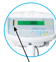
LED Lights for check weighing